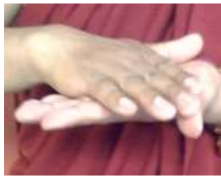
2. Yam (wind)