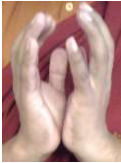
3. Ram (fire)