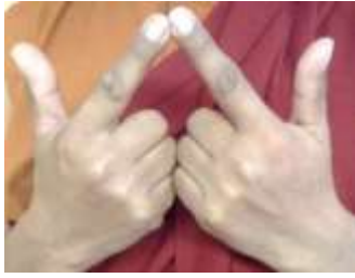
1. A (space)