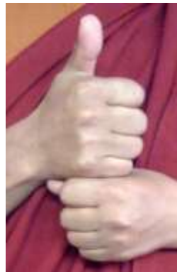
6. Drum (jewel)